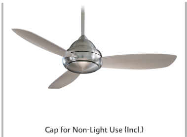
Cap for Non-Light Use (Incl.)