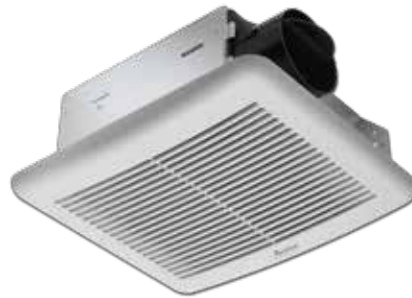
BreezSlim SLM50 (formerly VFB050B3A1) 50 CFM Single Speed Fan

Innovative DC brushless motor design for long life, low noise, and low power consumption.