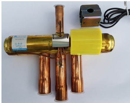
4-Way Reversing Valve