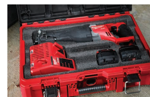
Customizable Foam Insert

Modular Connectivity with All PACKOUT™ Components