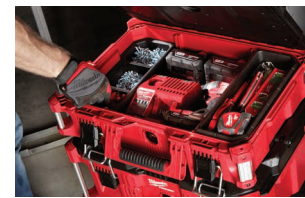
Interior Organizer Trays