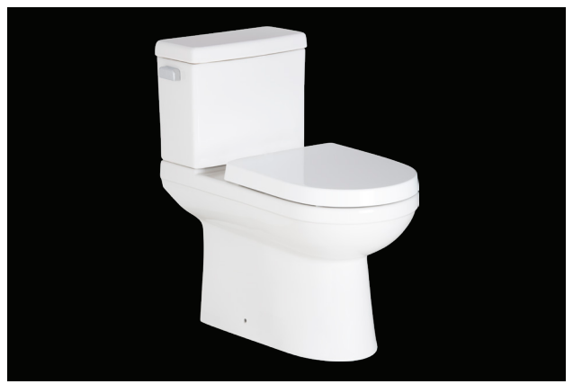
PF9602SWH / PF9612WH