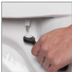
STA-TITE® SEAT FASTENING SYSTEM™