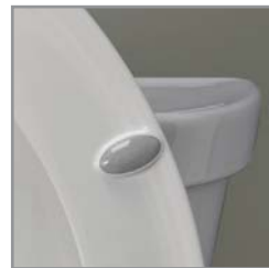
SUPER GRIP BUMPERST™