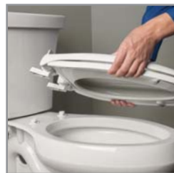
EASY REMOVAL OF SEAT FOR THOROUGH CLEANING