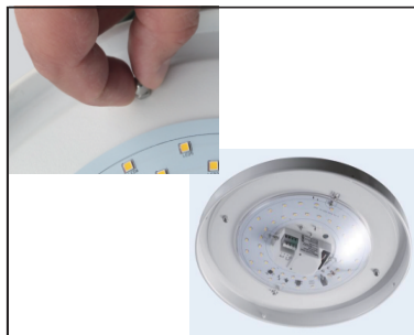
Step 3 Attach base of fixture to mounting bracket using two nuts (provided).