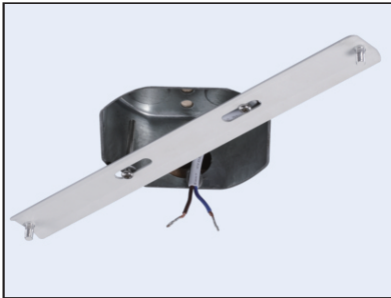
Step 1 Attach installation bracket to junction box using two screws (provided)