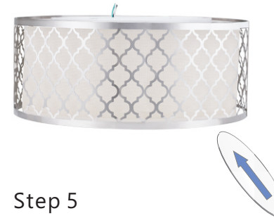
Step 5 Remove protective film on diffuser (provided). Tilt the diffuser and slide into drum. Gently rest it on bottom of drum.