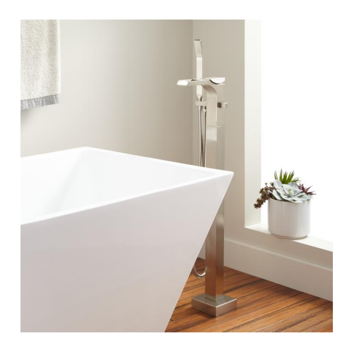
ASME A112.18.1/CSA B125.1