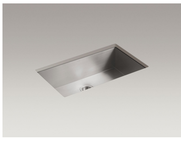
Codes/Standards ASME A112.19.3/CSA B45.4