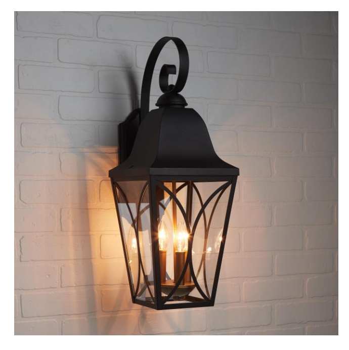
CODES/STANDARDS UL 1598 / CSA C22.2 No 250.0