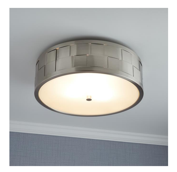
CODES/STANDARDS UL 1598 / CSA C22.2 No 250.0