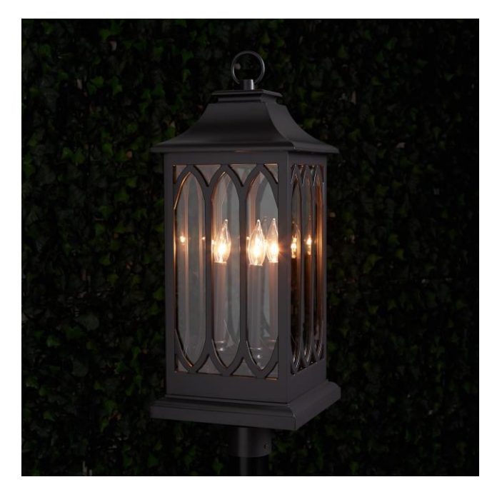
CODES/STANDARDS UL 1598 / CSA C22.2 No 250.0