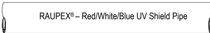
RAUPEX ® – Red/White/Blue UV Shield Pipe

Product: RAUPEX ® UV Shield Pipe (Red/White/Blue) Date: 31 March 2019 (supersedes 01 January 2017)