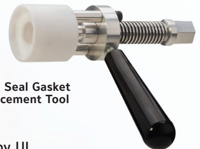
Rapid Seal Gasket Replacement Tool

NOTE: The gasket replacement tool and process have not been evaluated by UL.