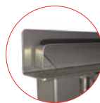
C: FILTER RACK WITH STOPPER TO FIX FILTERS WELL