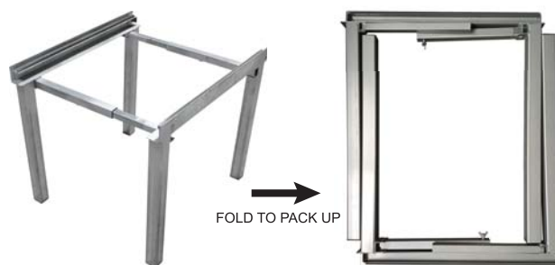
D: FOLDABLE STRUCTURE DESIGN TO SAVE SHIPPING AND STORAGE SPACE (PATENT PENDING)