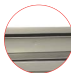
B: RUBBER STRIPS INCLUDED TO MINIMIZE VIBRAION