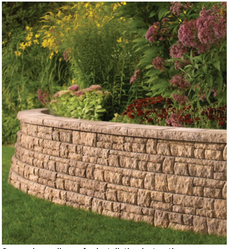
See anchorwall.com for installation instructions.

Anchor Wall Systems, Inc., 5959 Baker Road, Suite 390, Minnetonka, MN 55345. A&B0810 72.3052.1 08/11 4015