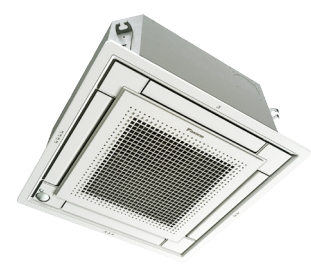
Shown with panel BYFQ60C2W1W