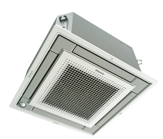
Shown with panel BYFQ60C2W1S