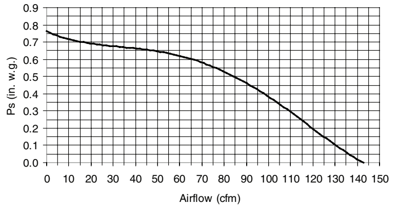
MODEL QT130E Using 6" round duct or 4" round duct