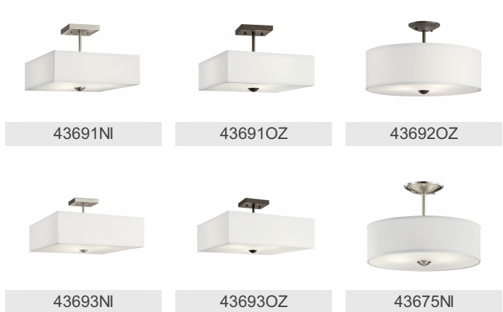
43691NI 43691OZ 43692OZ 43693NI 43693OZ 43675NI