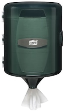
DISP M23 CFEED TWL SMK 1/CS 93T