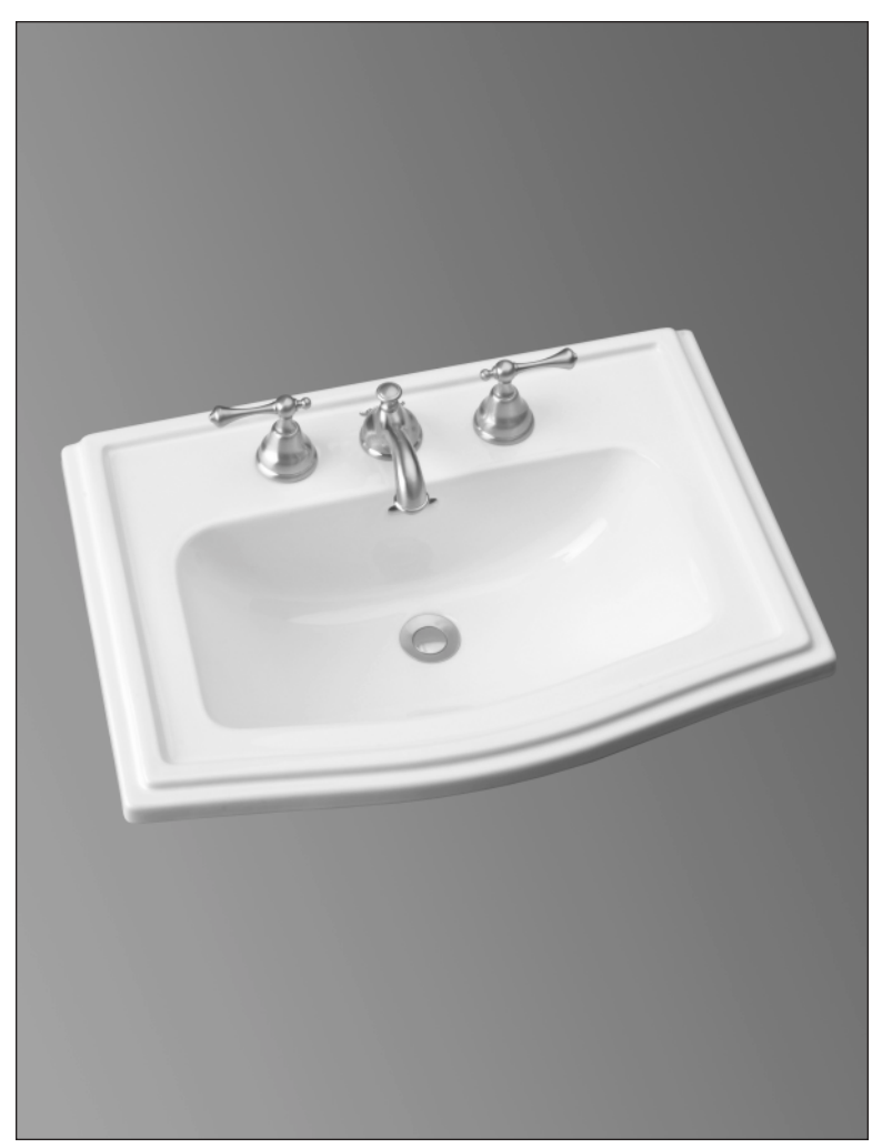
LT781.8 - Baldwin Self-Rimming Lavatory