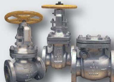
#1155, 2155, 3155