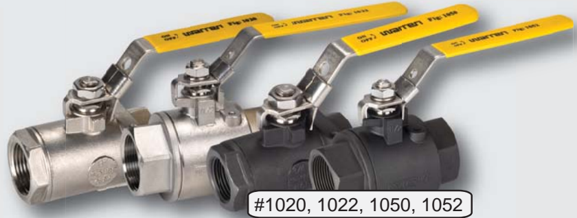
#1020, 1022, 1050, 1052