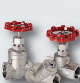
#221, 222, 223