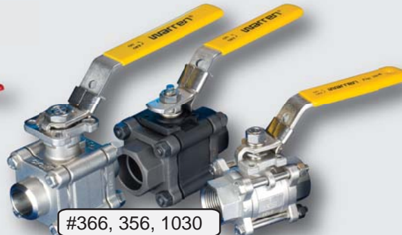
#366, 356, 1030