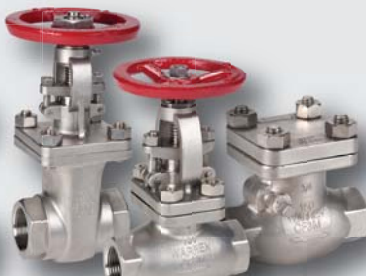
#1156-T, 2156-T, 3156-T