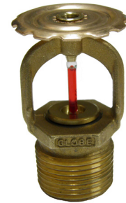
SERIES GL-ECOH EXTENDED COVERAGE ORDINARY HAZARD UPRIGHT GL1121

The heart of Globe's Series GL sprinkler proven actuating assembly is a hermetically sealed frangible glass ampule that contains a precisely measured amount of fluid. When heat is absorbed, the liquid within the bulb expands increasing the internal pressure. At the prescribed temperature the internal pressure within the ampule exceeds the strength of the glass causing the glass to shatter. This results in water discharge which is distributed in an approved pattern depending upon the deflector style used.