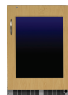
Framed Overlay (Panel Ready)*