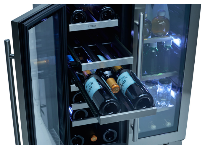
Full Extension Wood Racks