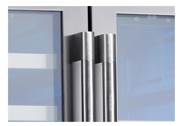
Optional Pro Handles