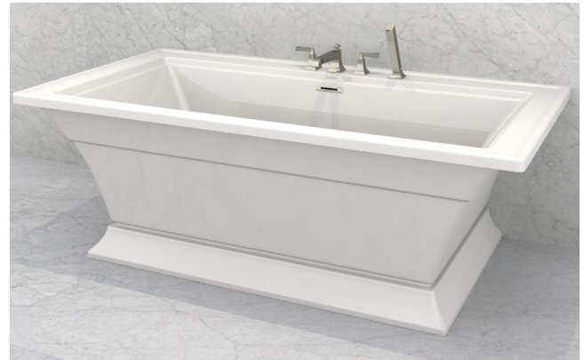
*Deck mount filler and overflow cover sold separately.

SEE REVERSE SIDE FOR ROUGHING-IN DIMENSIONS AND PRODUCT SPECIFICATIONS