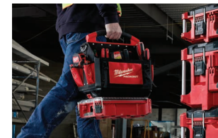
Optimized Storage Capacity