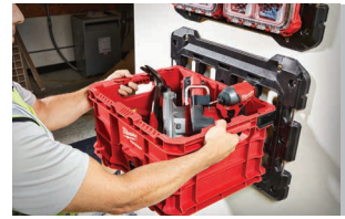
Stack or Hang