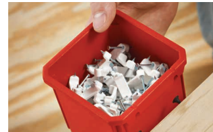
Removable & Mountable Bins