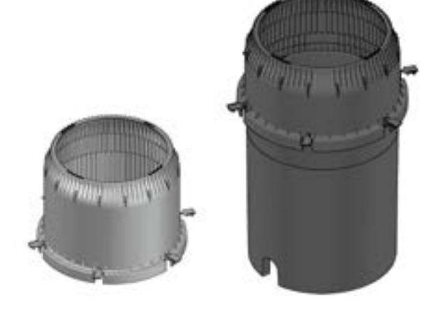
Injection Molded Meter Pit Extension