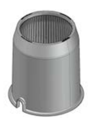
Bullet-Nosed Meter Pit