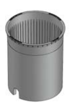
Straight-Walled Meter Pit