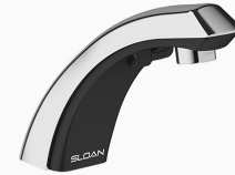
Variation not shown: 4" Trim Plate