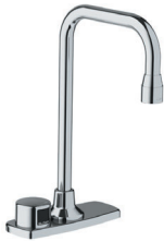
EBF-775 Deck Mount, battery ETF-770 Deck Mount, hardwired