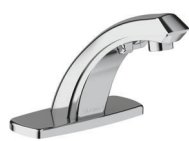
EBF-85 Deck Mount, battery EBF-187 Deck Mount, battery ETF-80 Deck Mount, hardwired ETF-880 Deck Mount, hardwired