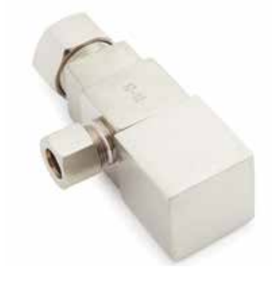
REVISED 09/17/2019 CODE: SH206BN/SH206CP