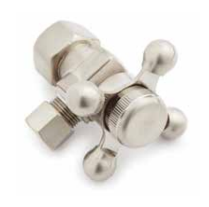
REVISED 09/17/2019 CODE: SH204BN/SH204CP SH204ORB/SH204PB/SH204PN

All\ dimensions\ and\ specifications\ are\ nominal\ and\ may\ vary.\ Use\ actual\ products\ for\ accuracy\ in\ critical\ situations.