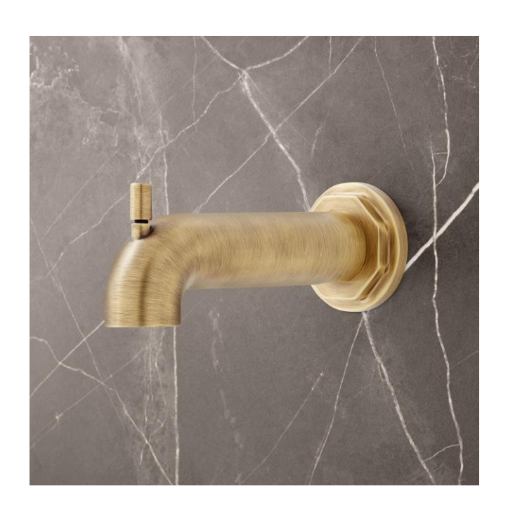
ASME A112.18.1/CSA B125.1 Massachusetts Accepted