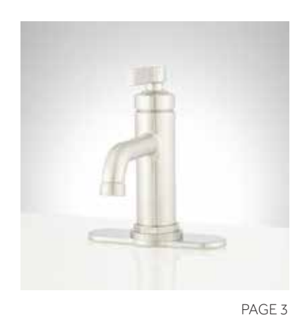
Code: SHWSCGF100BN, SHWSCGF100PN SHWSCGF100CP