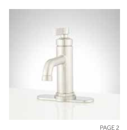
Code: SHWSCGF100BN, SHWSCGF100PN SHWSCGF100CP

All \ dimensions \ and \ specifications \ are \ nominal \ and \ may \ vary. \ Use \ actual \ products \ for \ accuracy \ in \ critical \ situations.