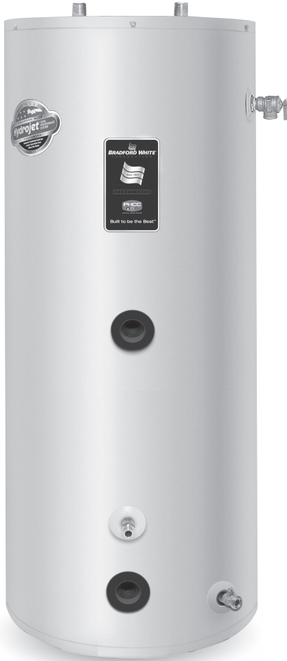
Photo is of SW-2-65-L