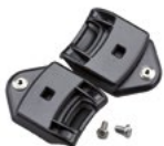
WAC00003 ADAPTER WITH BAYONET