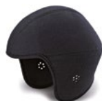
UPA00001 WINTER PADDING