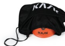
UAC00002 HELMET BAG