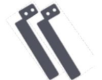
L-shape Brackets (2)