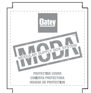
Sticker Cover (For Debris Protection)