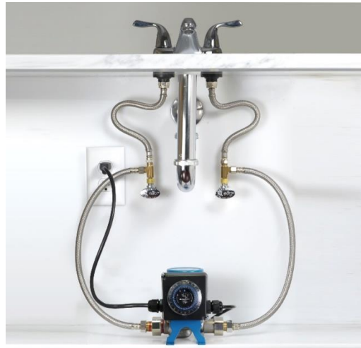
APCOM Model #UT1 Installation Picture