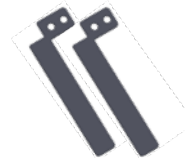
L-shape Brackets (4)