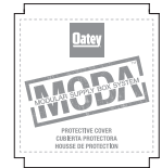
Sticker Cover (2) (For Debris Protection)