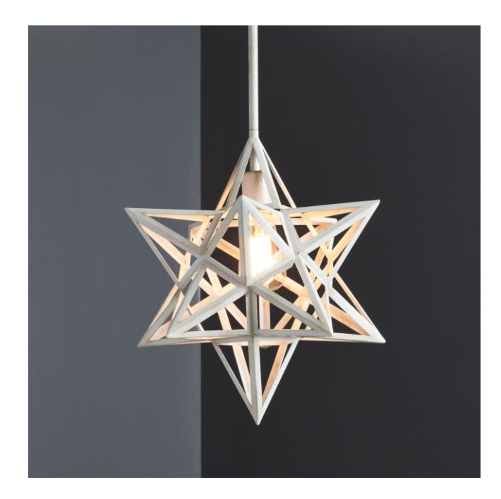
CODES/STANDARDS UL 1598 / CSA C22.2 No 250.0