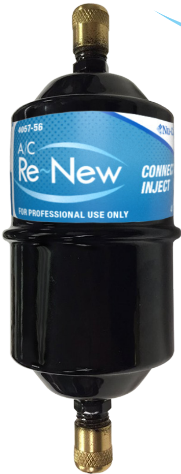
Part Number: 4057-56

Nu-Calgon's A/C Re~New Connect Inject is a specially formulated treatment with years of proven field history in enhancing system performance in a quick one-time disposable injector.