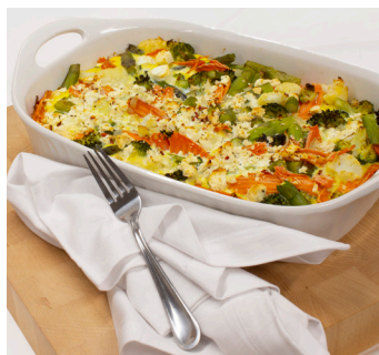
Extra-large, full-sized 2.2 cu. ft. capacity, to cook and reheat larger serving trays and casserole dishes

Innovative features like One-Touch controls, Sensor Cook Technology, Auto Defrost and the Carousel turntable system make cooking and reheating your favorite foods, snacks and beverages easier. With decades of experience designing smart, innovative microwaves, it's easy to see why home cooks throughout the world trust Sharp Carousel.