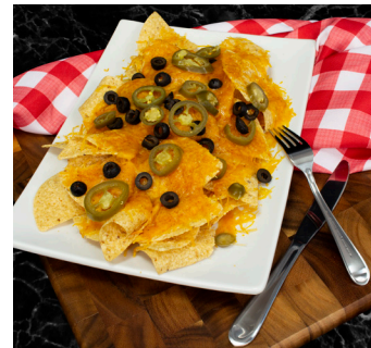
Sensor cook menu for precise cooking and reheating