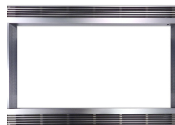
RK52S27 / RK52S30

Internal capacity calculated by measuring maximum width, depth and height. Actual capacity for holding food is less.