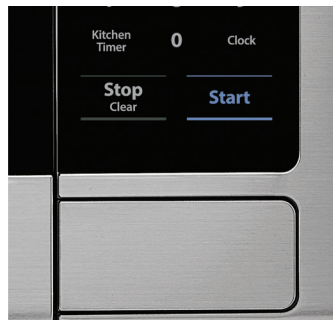
Handle-less, push door modern design matches all styles of kitchens