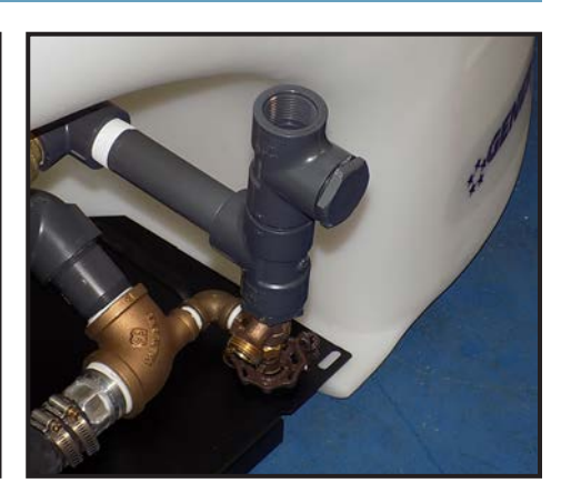
Thread the riser into manifold and tighten until riser is in an upright position.