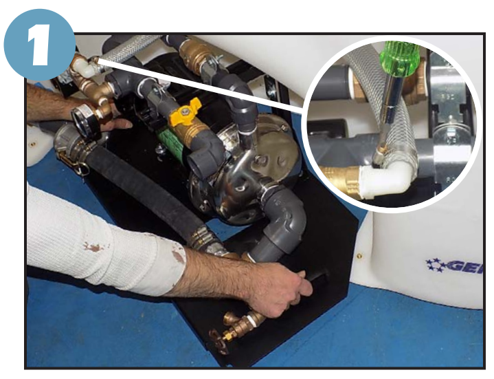
Using the handles on base, slide the left side of pump assembly into the tank opening & connect test hose.