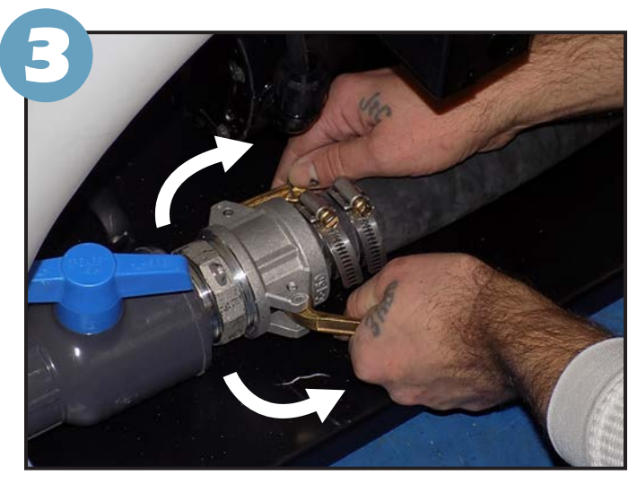
Install the hose & lock the clamps on cam fitting.