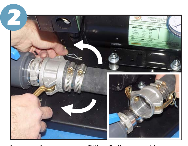
Loosen clamps on cam fitting & disconnect hose.