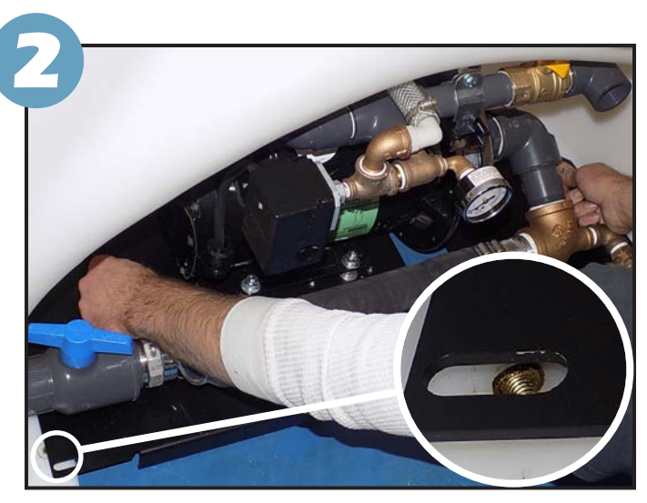
Position the pump assembly so the slots in the base line up with the nuts on both sides.