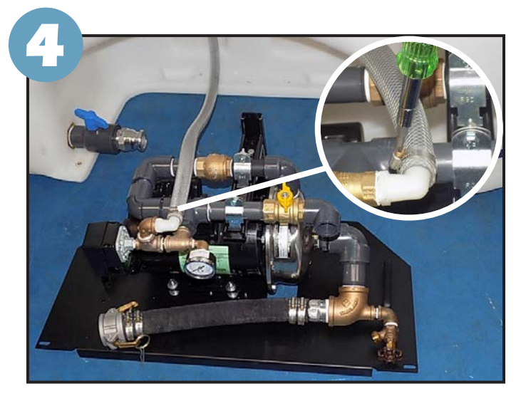
Continue to pull the pump assembly out by the base plate handles & disconnect the test hose.