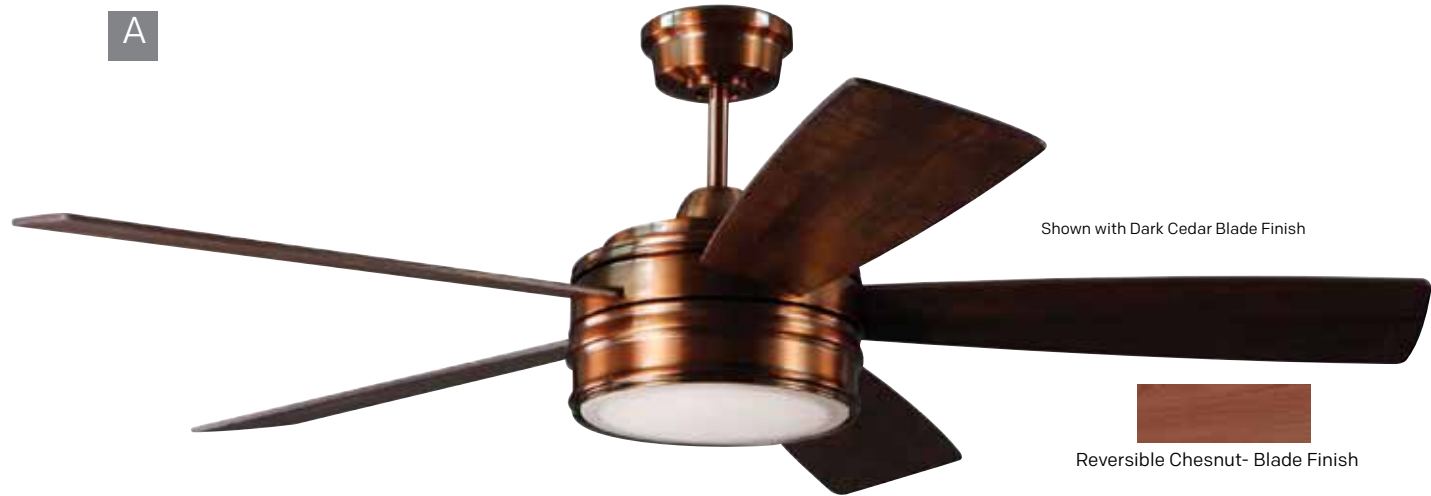
Shown with Dark Cedar Blade Finish