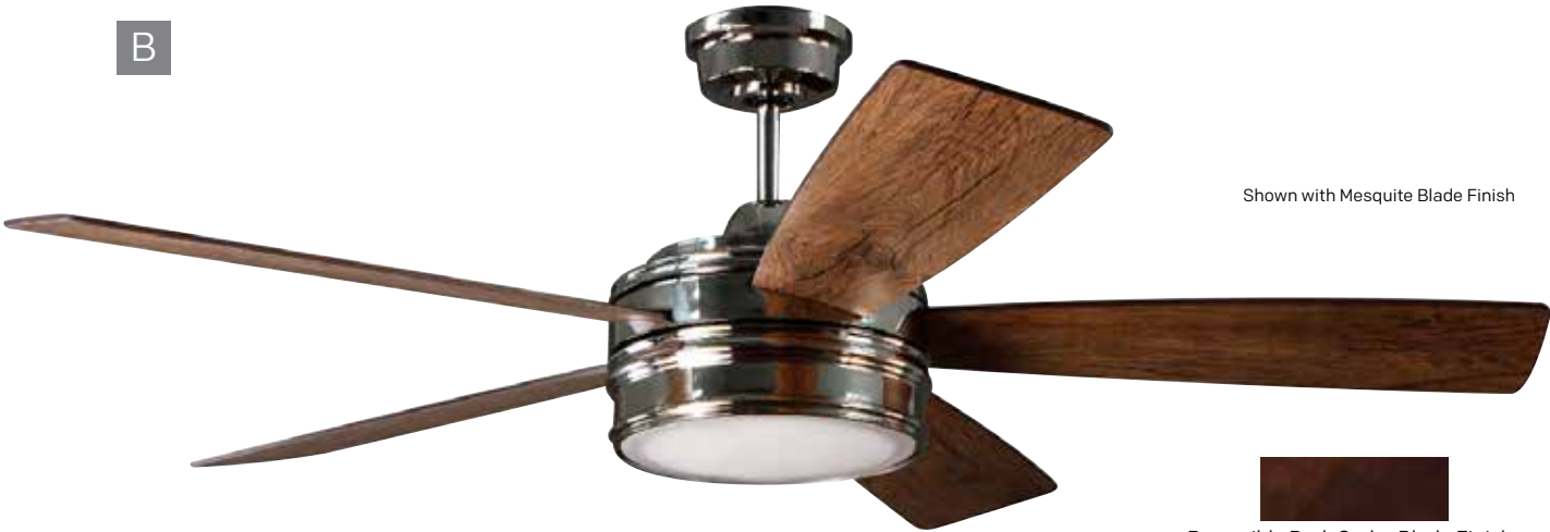
Shown with Mesquite Blade Finish