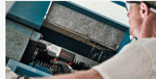
Heavy Equipment Repair