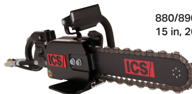
880/890 Series Hydraulic Saws, 15 in, 20 in and 25 in Chains and Bars