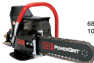
680ES Gas Saw 10 in Chain and Bar