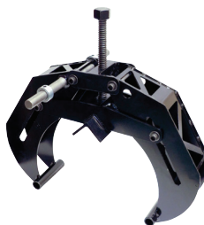
Pipe Clamp Accessory (for 880/890 & 701-A saws only)