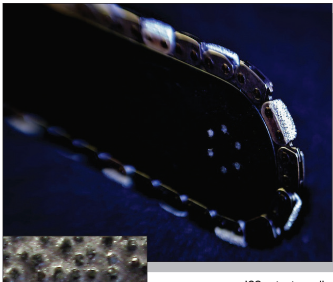
Braided Diamond Layer

*Asbestos is a hazardous material, known to cause serious respiratory diseases. Cutting into asbestos can release asbestos fibers into the air. Always research and follow the correct safety procedures, including applicable national and state or provisional occupational health and safety regulations, and protect yourself and those around you from asbestos-related disease. Always arrange for the material to be removed safely by a qualified person. ICS is not responsible for exposure to asbestos caused by use of this product.