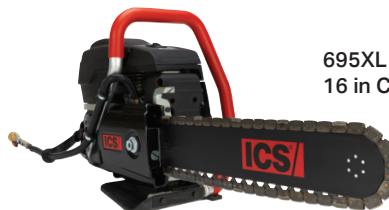
695XL Gas Saw, 16 in Chain and Bar