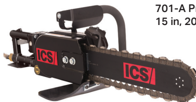
701-A Pneumatic Saw, 15 in, 20 in and 25 in Chains and Bars