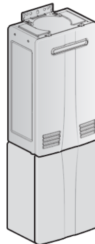
NAVIEN WATER HEATER OUTDOOR MODEL