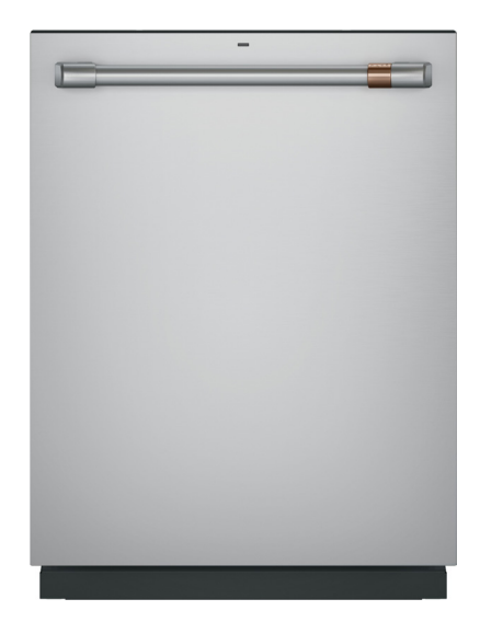
CDT800P2NS1 Stainless Steel with Brushed Stainless handle