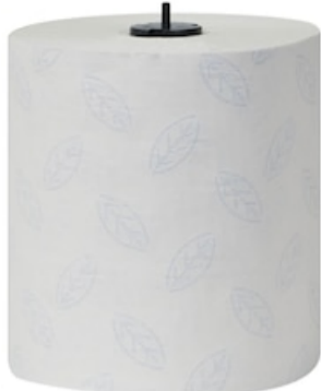
ADVC HARDROLL TWL WHT 2PLY 6 /525 290092A