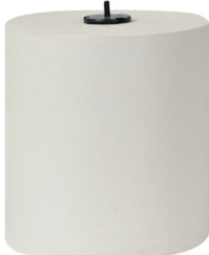
ADVC SOFT HARDRL TWL WHT 1PLY 6 /900 290095