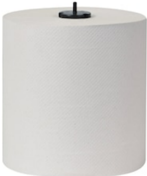
UNIV MATIC ROLL TOWEL WHT 6 /700 290089