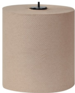
UNIV MATIC ROLL TOWEL NAT 6 /700 290088